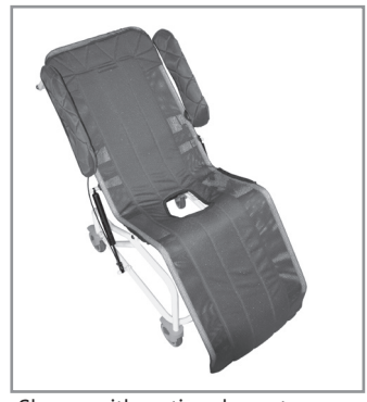
Shown with optional aperture and quilted side rails