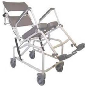
Aquamaster Tilt in Space Chair